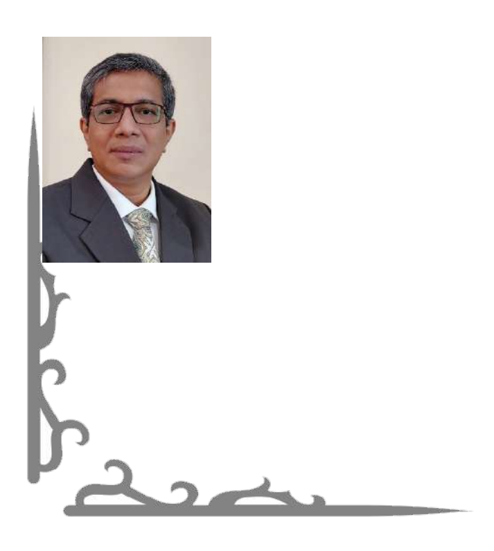
Dean Faculty of Medicine of Udayana University

Therefore, through this event, we hope that nurses, academics, and experts in the field of nursing can share experiences and knowledge about various innovations in health nursing. It is expected that participants will be inspired and motivated in developing better nursing practices, education and conducting research in dealing with the current situation.